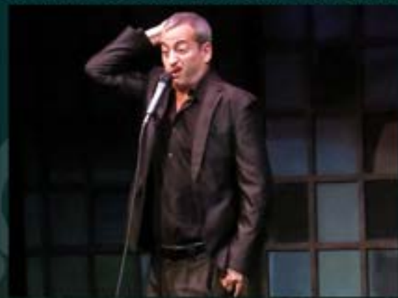
Comedian Ron Feingold performing at The Comedy Zone.