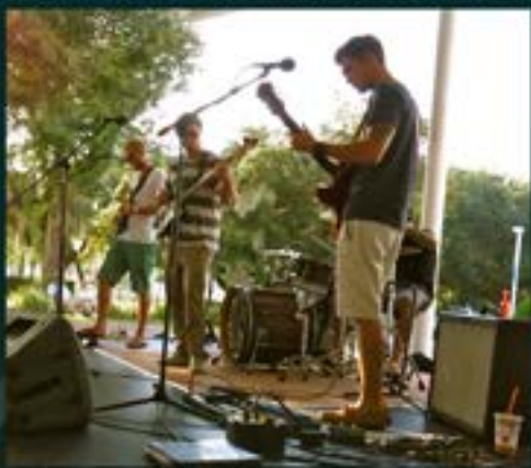
The Ohana Band performing before The Comedy Zone.

SUMMER NIGHTS CONTINUE THROUGH AUTUMN NIGHTS