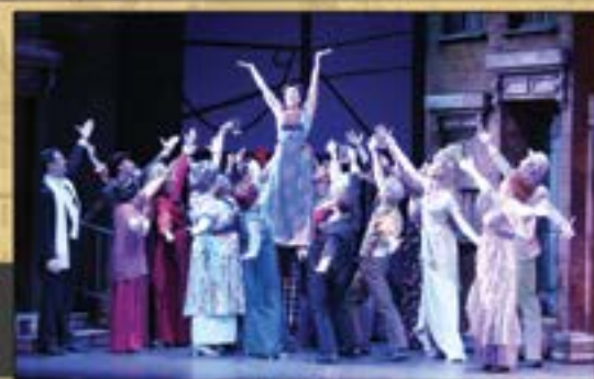
Funny Girl January 2013