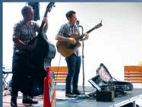
The Sweet Chariots play for the early crowd.