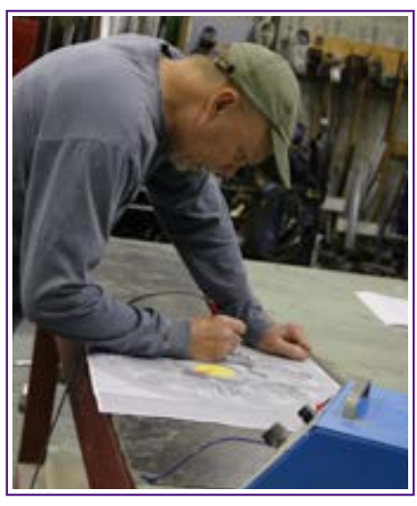
Scenic technician etches a design into medal.