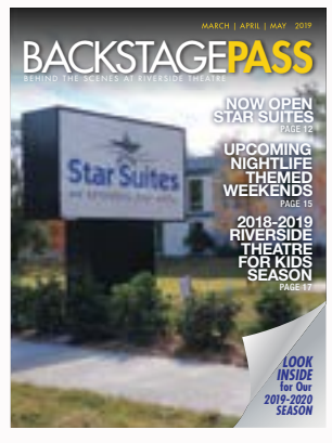
MAR | APR | MAY 2019 Issue