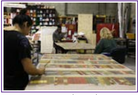
Scenic artists in the paint shop.

WANT TO KNOW MORE Behind-the-Scenes?? SIGN-UP FOR A 3 WEEK LECTURE-STYLE CLASS BACKSTAGEACCESS MARCH 7, 14, 21 • 10AM - 12PM