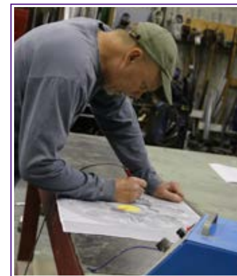
Scenic technician etches a design into metal.