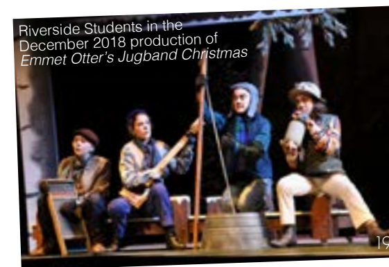
Riverside Students in the December 2018 production of Emmet Otter's Jugband Christmas