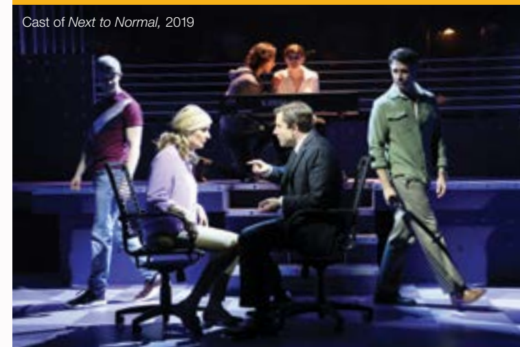
Cast of Next to Normal , 2019