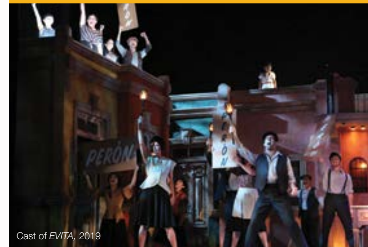
Cast of EVITA , 2019