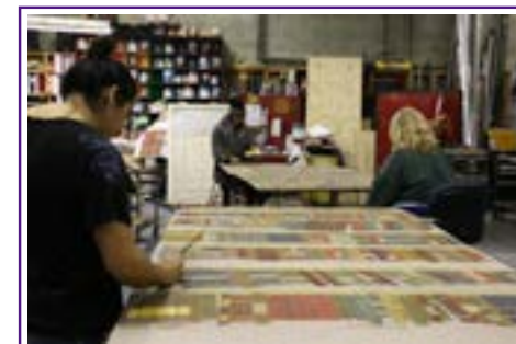
Scenic artists in the paint shop.