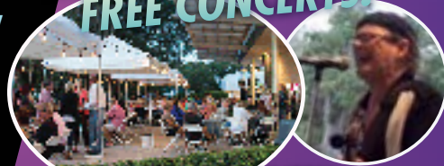
DOO-WOP, COUNTRY & ROCK BANDS!

COME HUNGRY... OUTSIDE GRILL... FREE CONCERTS!