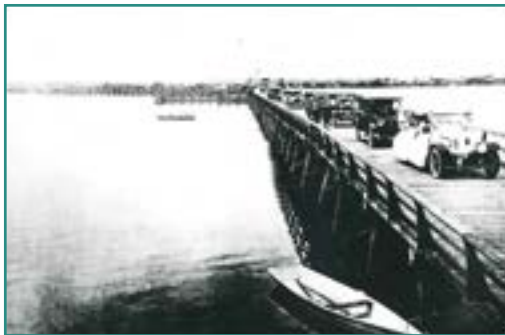
(Above) Opening of old Vero Beach Bridge on Labor Day, SEPTEMBER 6, 1920

walking/exercise trail, and a boat ramp, while north of Dalia would incorporate the cultural aspects of the park. Through the ensuing years, various visions and proposals for the park were submitted including a plan in 1958 to build a giant glass tower.