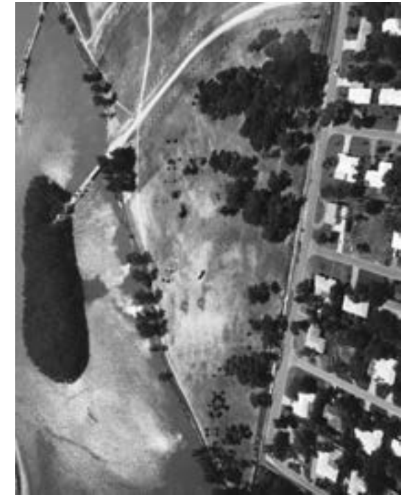
Schematic Land Use Plan of the Civic Arts Center