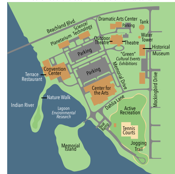
Recreated from the original plans by Holly Porch