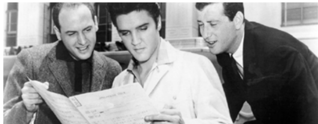
From left, Mike Stoller, Elvis Presley and Jerry Leiber at MGM Studios in 1957.

After Elvis' version of "Hound Dog" became a number one hit in 1956, they would continue to write more hits for him including the title songs for three of his movies— Loving You , Jailhouse Rock , and King Creole —as well as the rock and roll